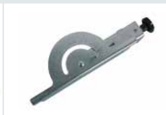
[ 3 ] Side stop