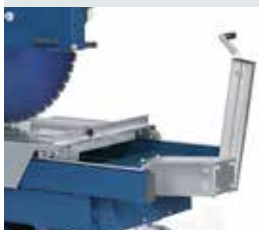
[ 1 ] DTS 1000 V