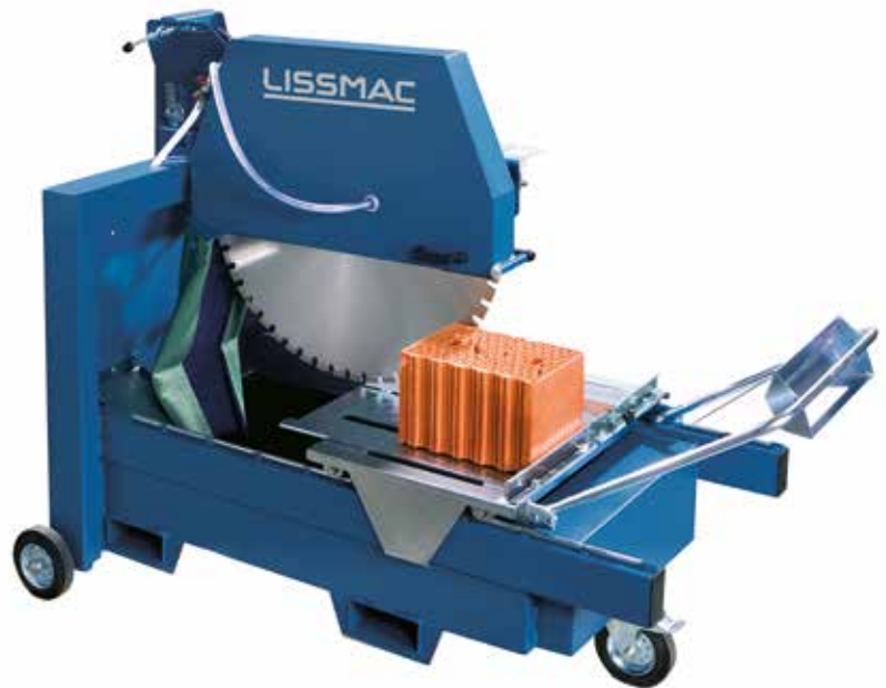
DTS 1000 H